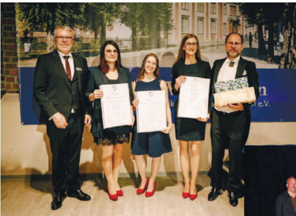
Graduation ceremony at the at the ZVA Akademie (Knechtsteden, Germany)

Graduation ceremonies for the EDO have taken place at the ZVA Akademie (Knechtsteden, Germany), at the Fachhochschule Nordwestschweiz, (Olten, Switzerland), at the University of South-Eastern Norway (Kongsberg, Norway) and at the University of Applied Sciences Utrecht (Utrecht, the Netherlands). The OHI GmbH, Optometrie & Hörakustik Initiative (Vienna, Austria) awarded the EQO during their ceremony.