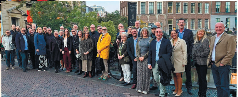
ECOO delegates on their way to dinner in Utrecht

The workshop session focused on strategic management for national associations, with group discussions on how to identify and engage stakeholders, knowing what members want and how to work with them, and putting in place a strategic plan. Delegates particularly appreciated hearing the range of different experiences and perspectives of colleagues on these issues.