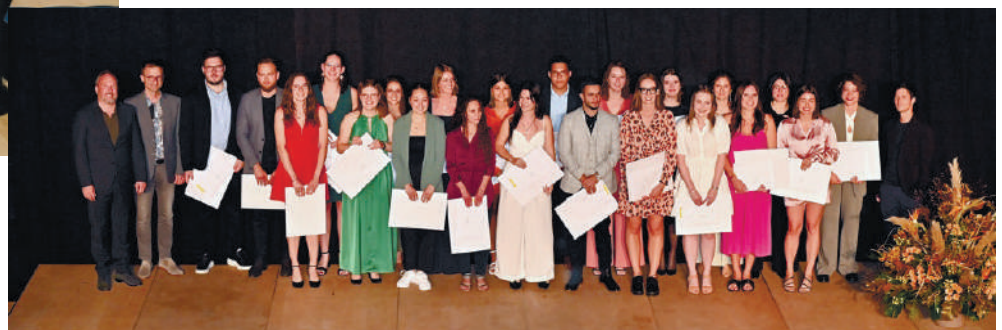
Graduation ceremony at the Fachhochschule Nordwestschweiz, (Olten, Switzerland)

The accreditation team has kept busy in the second half of this year with visits to the Institut des Sciences de la Vision in St Etienne, France and a visit planned in November to the University of Latvia. In light of the increasing interest in the accreditation scheme, ECOO has also expanded its pool of visitors.